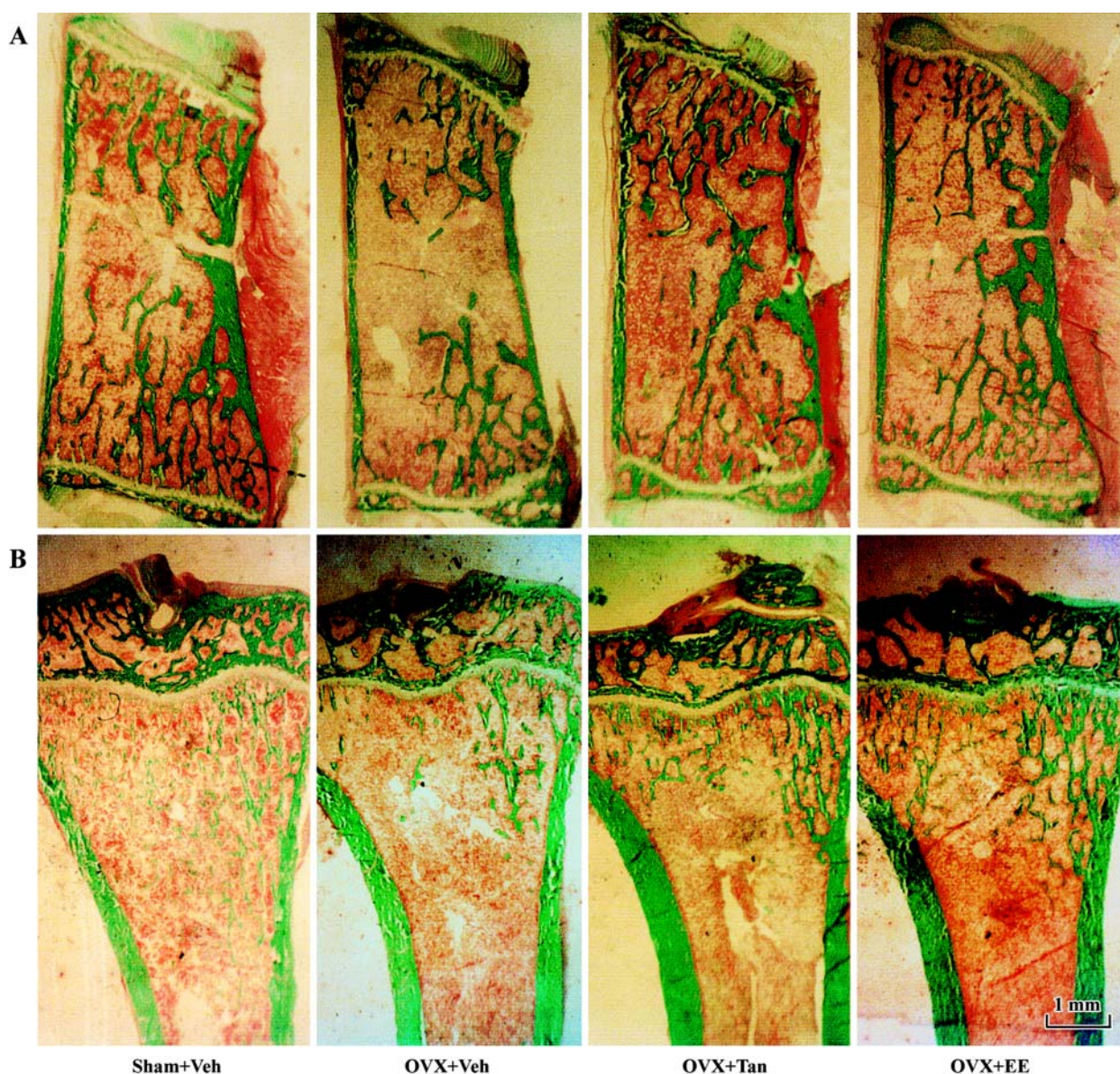
Fig 2. Microphotographs of the sagittal sections of fourth lumbar vertebrae (LV4, A) and longitudinal sections of right proximal tibial metaphysis (PTM, B) from sham control (Sham+Veh), OVX control (OVX+Veh), and OVX rats treated with total tanshinone (OVX+Tan) and 17 \alpha -ethynylestradiol (OVX+EE) for 10 weeks. Less trabecular bone and poor trabecular structure are seen in the OVX rats compared with sham control. Tan and EE treatment completely prevent cancellous bone loss in LV4 but partially prevent cancellous bone loss in PTM. Goldner's Trichrome staining, A) original magnification \times 20 ; B) original magnification \times 12 .

with both sham and OVX rats treated with vehicle; 3) OCS/BS was significantly lower than that in vehicle-treated OVX rats but still significantly higher than that in sham rats; 4) MS/BS and BFR/BS were not different from vehicle-treated OVX rats whereas MAR and BFR/BV were significantly decreased compared with vehicle-treated OVX rats. Similar to tanshinone treatment, EE partially prevented bone loss at the PTM of OVX rats. However, it significantly decreased MS/BS and BFR/BV and had no effect on TbTh in OVX rats (Fig 2B, 3